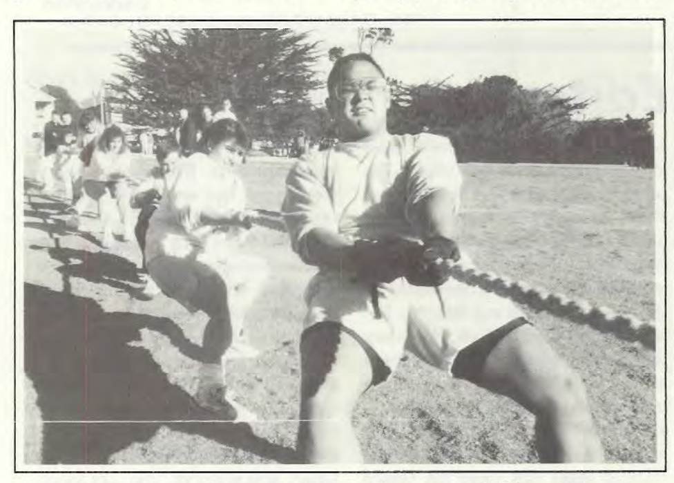
Tug-of-war, one of the many Organization Day activities, drew many competitors to spend their strength.