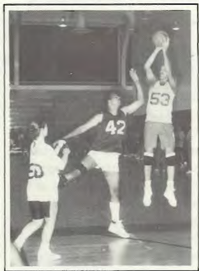
Basketball was just one of the competitive sports held during Organization Day.