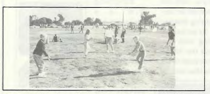
Organization Day offered one time parents didn't mind their children playing with water balloons.