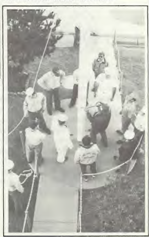
Naval Security Group Detachment members secure the new yardarm.

The new yardarm adds a touch of color and a great deal of Navy tradition. Each day the signal flags offer a new message. Take a few extra seconds and look at the various flags and experience a Naval custom that has been around for centuries.