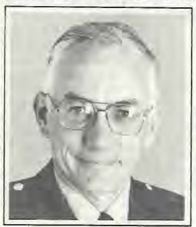
sert Shield. The second reason is the dramatic Commandant, DLIFLC

The first reason for change is fairly obvious: Operation Desert Shield. The second reason is the dramatic rise in safety-related