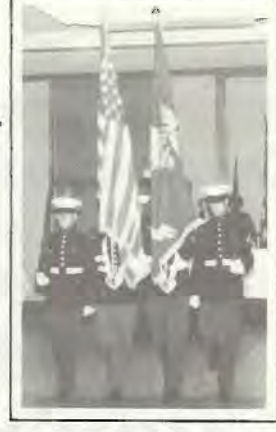
DLI MCD color guard