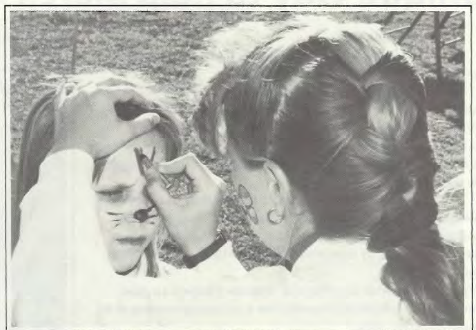
f and family members converged on Soldiers