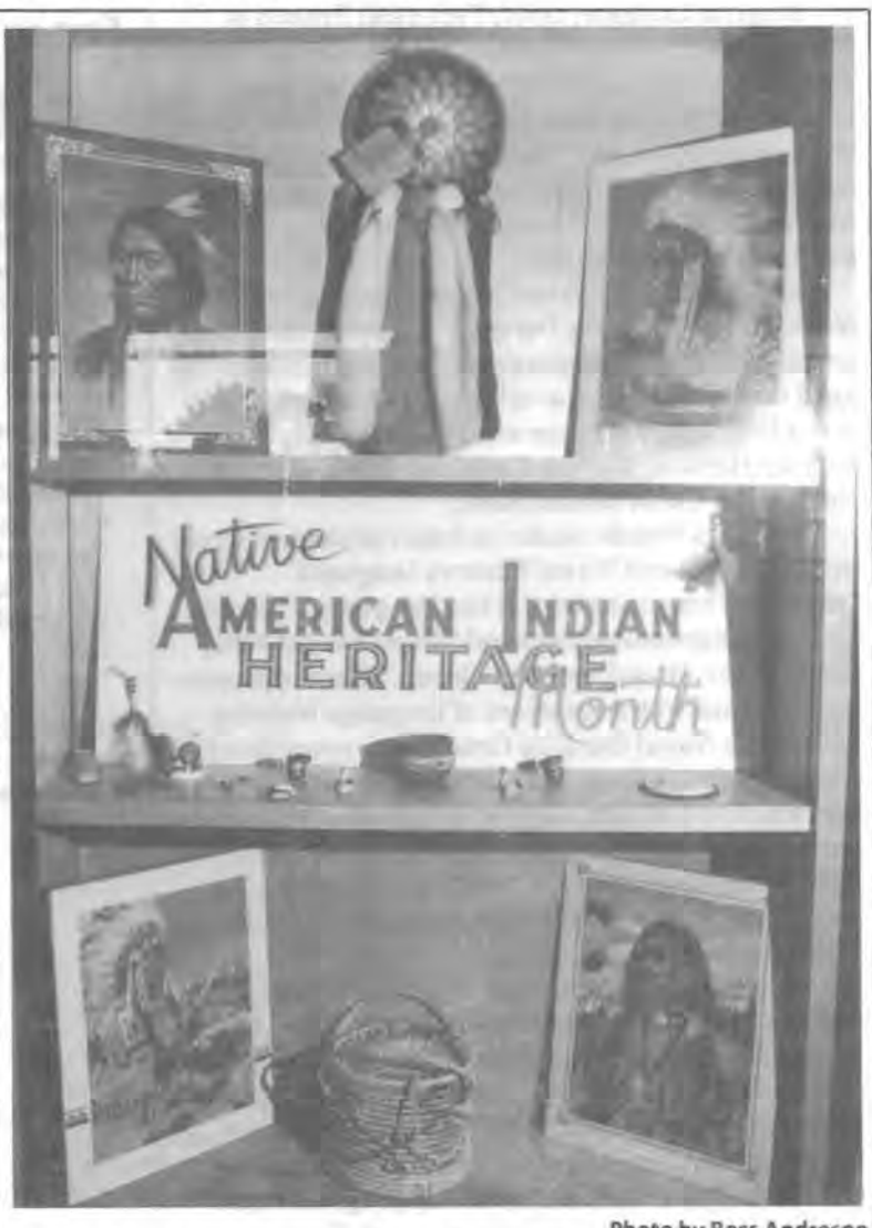
The Defense Language Institute observed American Indian Heritage Month with a display of Native American artifacts and pictures in the lobby of Rasmussen Hall. This year's theme was Identity, Integrity, Tenacity -- Enduring Traits of American Indi-ans. Aiso Library also provided a heritage display.

The dance arena can be any open ground large enough to comfortably accommodate all the participants and spectators. The elders or medicine men bless the dance arena for the duration of the Powwow before any other activities have started. Once blessed, the dance arena becomes sacred ground - one of the major reasons that Powwow grounds are treated respectfully and reverently. The sacred ground might be compared to a church. Profanity, loud behavior and alcoholic beverages are not tolerated.