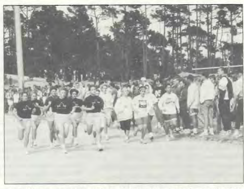
Delta Company women gain on Foxtrot women and pass to cross the finish line well ahead of the other teams during the Commander's Cup Race at Hilltop Track June 19.