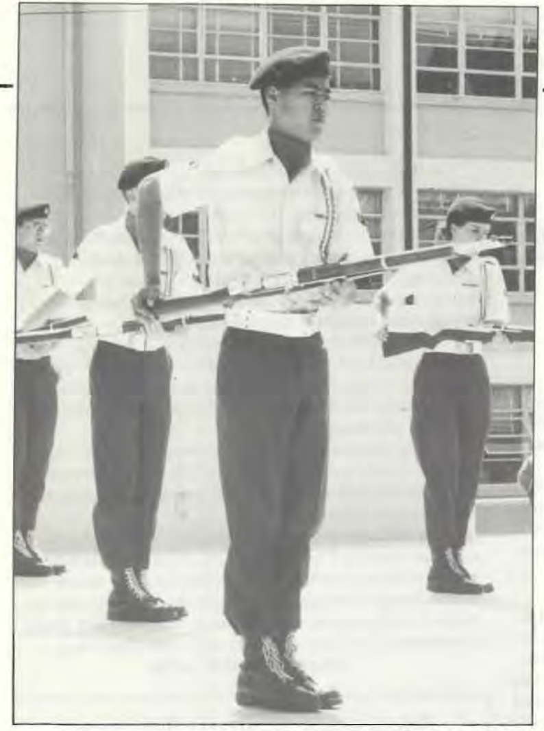
The Air Force Drill Team performs on DLI's outdoor stage during Language Day 1991 activities.