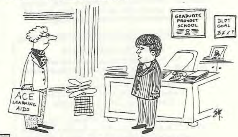
"Come now Mr. Steinbern. . . language vitamins?"