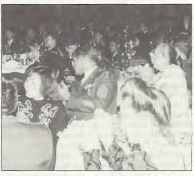
Guests applaud the entertainment during the Army Ball at the Monterey Hyatt Regency.

A DLI soldier models an Army uniform, circa World War I, during this year's Army Birthday Ball.