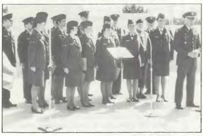
The Air Force Choir entertains during DLI's Language Day 1991.

Color guards, drill teams, choirs perform on July 4 and throughout the year