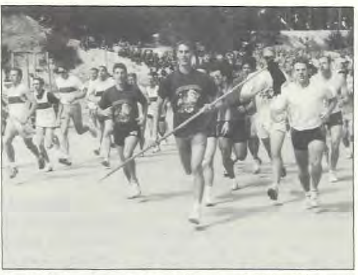
Leg to leg and nose to nose, the men of Alpha, Navy and HHC companies seem to run the race together. Seconds later Alpha took the lead and finished ahead of all the other teams.

Whatever their reason for running, having won 12 out of 13 races makes them a team to contend with. For the women's run, it was Delta