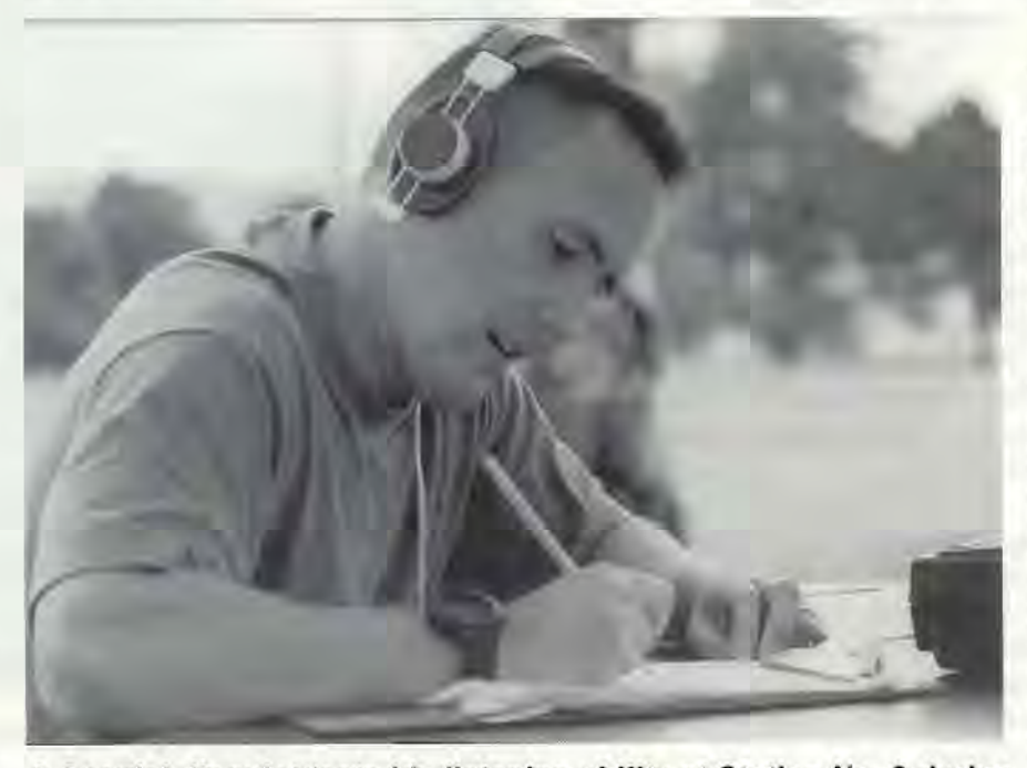
A Spanish linguist tests his listening ability at Station No. 2 during the Intel Marathon on Soldier Field for the Worldwide Language Olympics competition held at the Defense Language Institute Foreign Language Center.