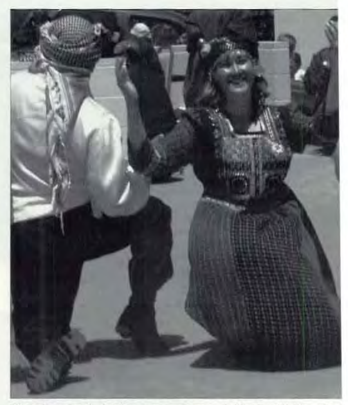
Dancing and singing were some of the festivities to t seen and heard during Language Day '99 at DLIFLC.