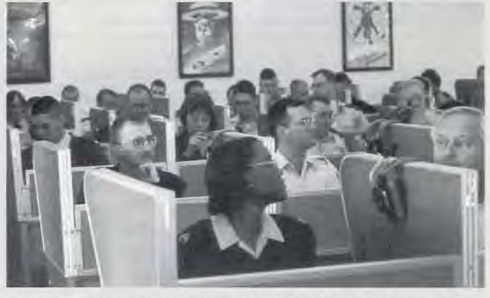
Russian linguists prepare for the Get the Point fame, which tested their reading comprehension skills in the target language