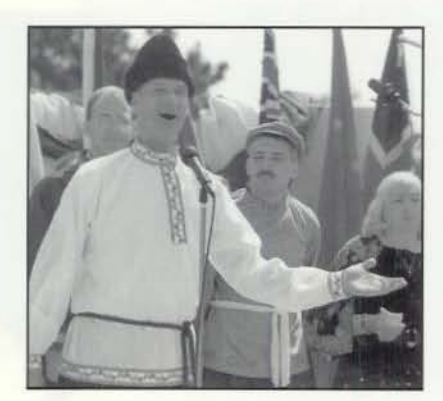
Singing Success: Looking for a great sound? DLIFLC's Russian Choir is guaranteed to keep you singing the song of the school's success. Find out when you can hear them today.