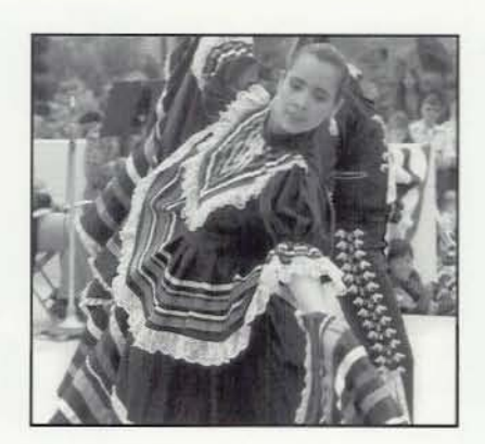
Keep on Dancing: Think you've got the best moves on the dance floor? You haven't seen anything until you've seen dance at DLIFLC.