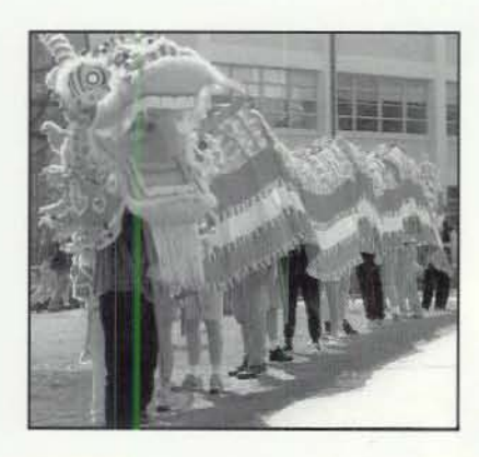
Fun Frolic: Want to enhance all that language learning today? Check out the cultural displays and get your passports signed.