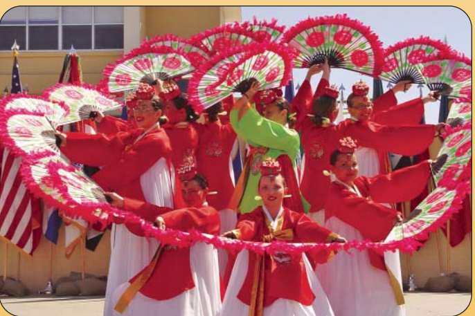
Korean students touch up their make-up just moments before performing the traditional Korean Fan Dance.