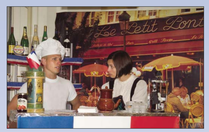
Experience the atmosphere of a Parisian bistro when you visit our colorful French display where DLIFLC students speak in the target language only.