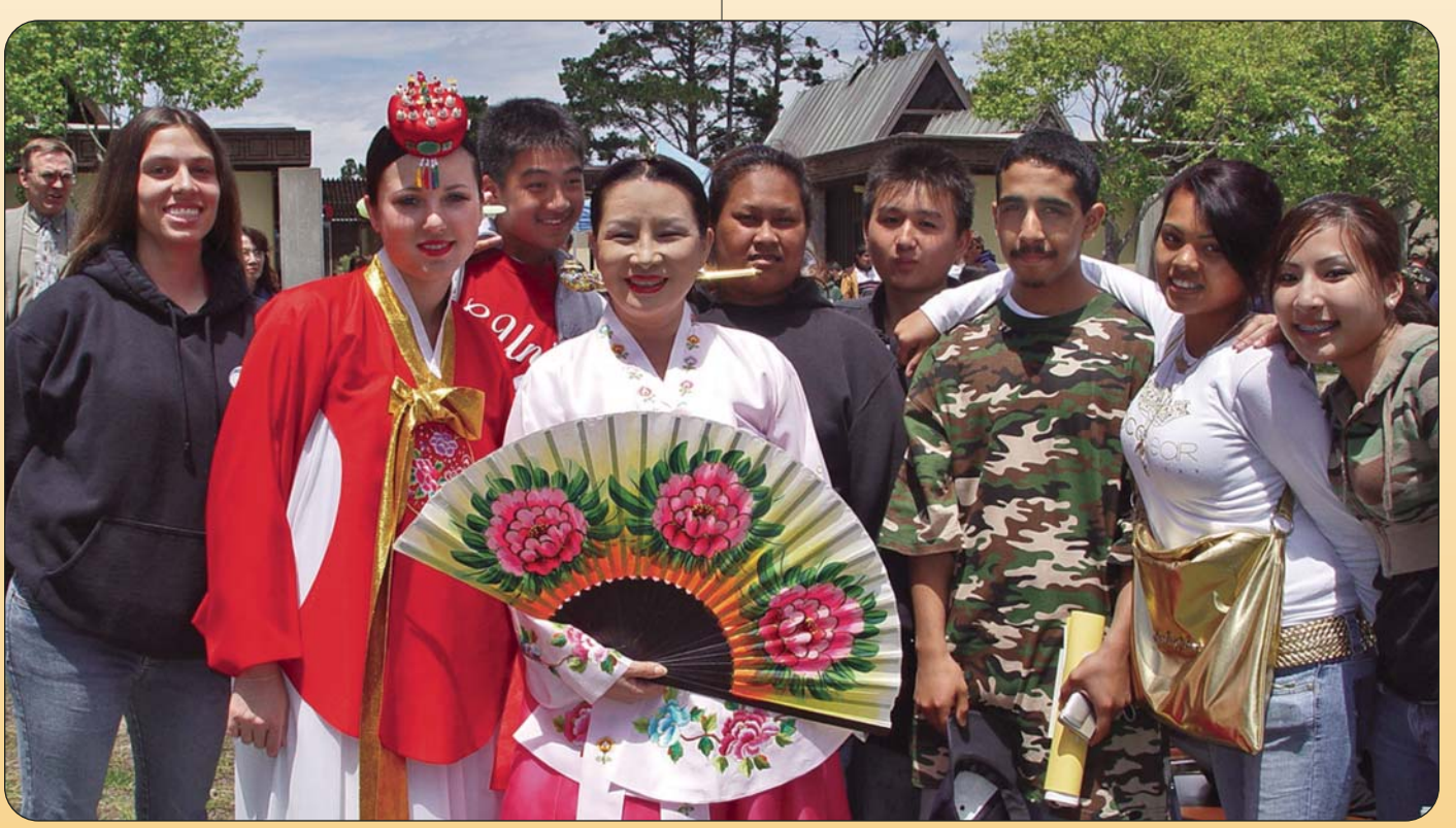
High school students from northern California pose with a DLIFLC Korean student and teacher on Language Day May 19, 2006.

Activities with Blogs – Motivate Your Students!