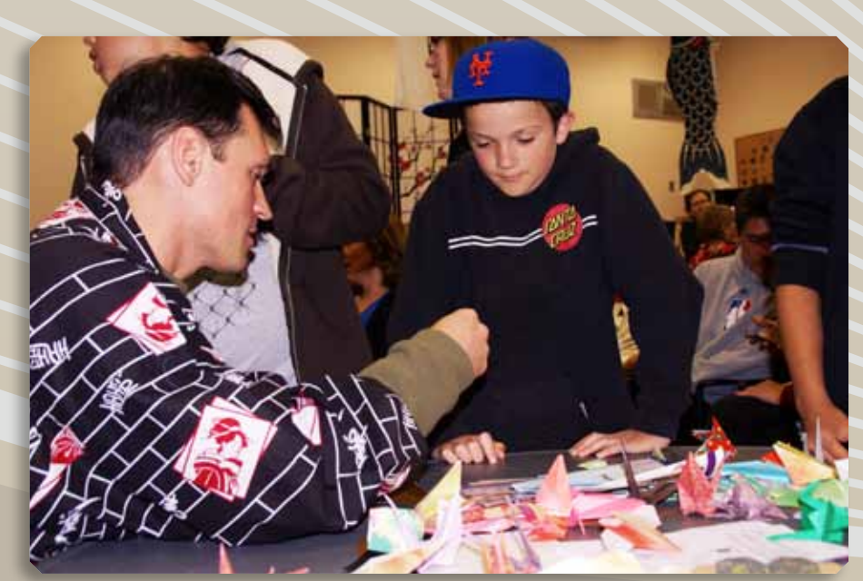
Have your name written in a foreign language! When visiting our cultural displays, ask students and DLIFLC faculty to write your name in Japanese, Arabic or Chinese!

For editorial comments or suggestions please write to natela.cutter@us.army.mil