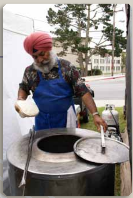
Take the opportunity to taste authentic food from India and experience something new!