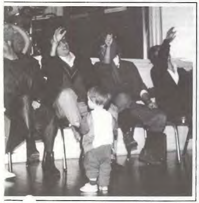
y act out their parts in a skit during the DLI Fasching