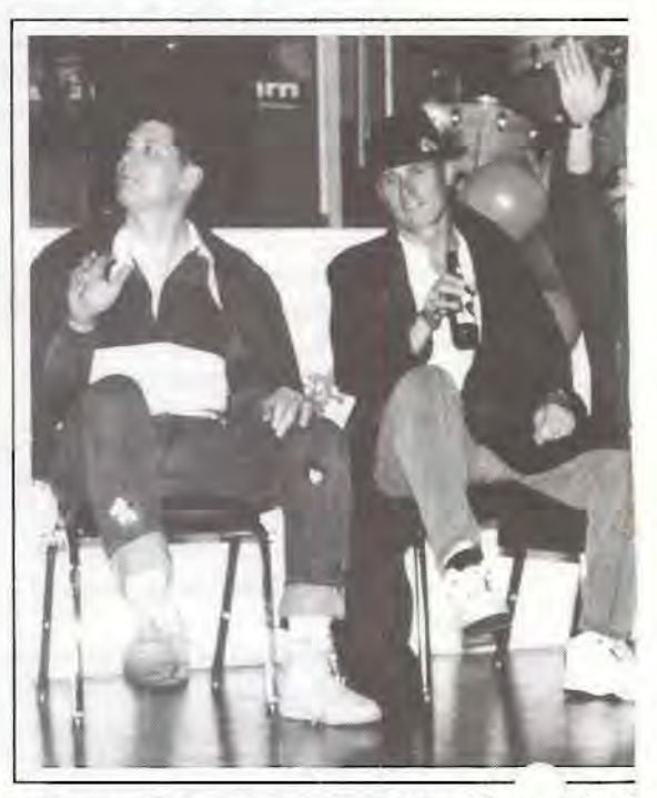
German Department students enthus, asticall Ball Feb. 26.