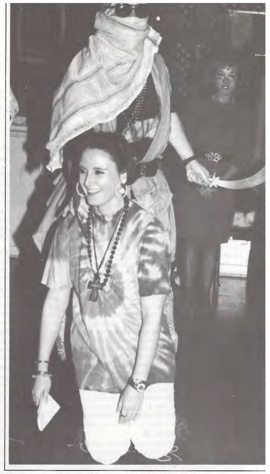
Contestants added a little stage acting in the best costume contest, hoping to garner more votes. Additional points just might cost the slave girl (above) her head.