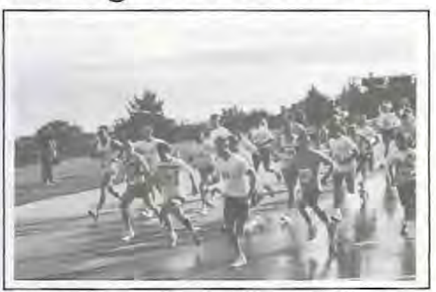
And they're off! Runners, Joggers and walkers sprint out from Sloat Monument in the 3rd annual Run with the Dream.

Contestants began arriving at 8:30 a.m. to limber up for the 9 a.m. start of the looped, hilly course. The course followed the Presidio's roads on a winding path up and down, over and around the entire length and width of the base. Many runners found laboring up the hills was arduous, as was maintaining a controlled pace on the downhills to eliminate the risk of shin splints. If anyone wanted to set a personal best in a 10K, this was not the race to try it. It was however, a perfect race and a perfect