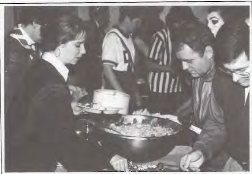
Revelers enjoy sausages, potato salad, rolls, bread and a variety of desserts during the Fasching Ball.