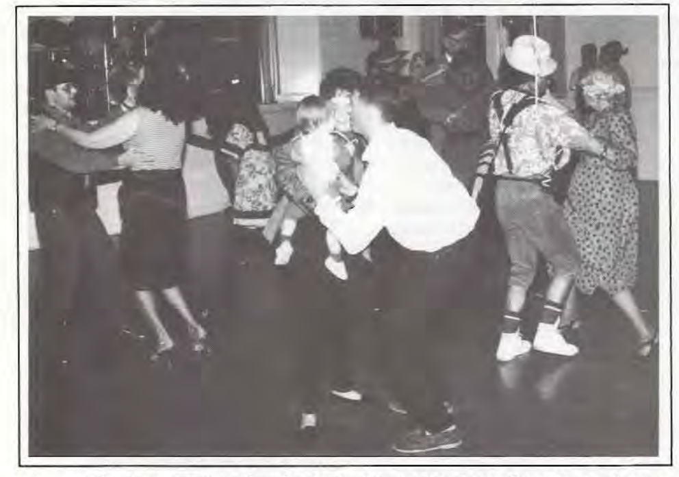
Live music gives revelers the chance to take to the dance floor for a mixture of German dancing and impromptu stepping.

The ball featured an authentic German band, German food, skits, singalongs, and prizes -- donat ed by local businesses -- for the best costumes. Besides traditional alpine-style dress, costumes repre sented modern German tourists, a geisha girl, Dracula, a Rastafarian, Renaissance maidens, a Portuguese senorita, a French dance-hall l, flow er children, Groucho, a leprechaun, cowboys and even satellites. Some of the most interesting costumes were hard to figure out.