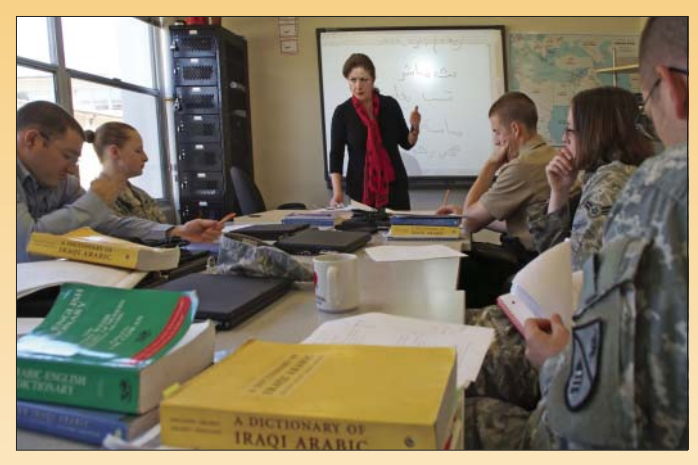
Students learn the Arabic Iraqi dialect from native-born speakers.

The Iraqi dialect students have been thus far testing